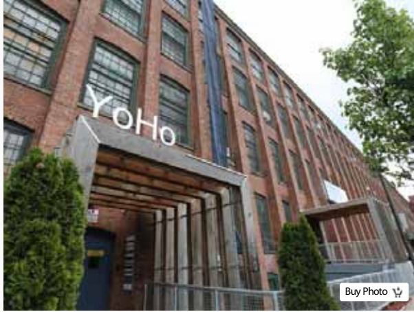
The exterior of the YoHo artists loft building in Yonkers where the new Westchester Center for Jazz and Contemporary Music is housed.

Besides the artsy vision for the former carpet mills, Elizabeth Sander said she was drawn to Yonkers because it's different from other parts of Westchester County.