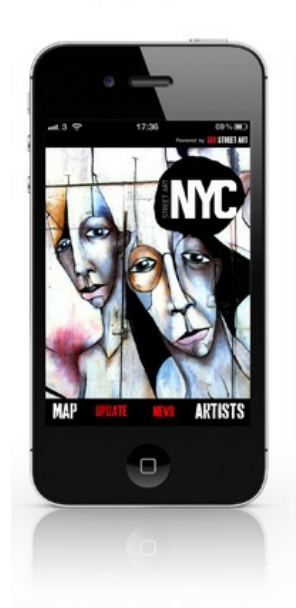
GEO STREET ART