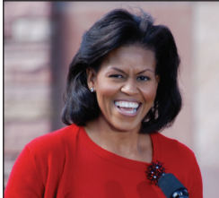
Above: First Lady Michelle Obama