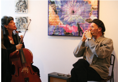
Above and left: A large and festive turnout for The Blue Door Gallery grand opening

YoHo Artist Studios Alexander Smith Carpet Mills Building