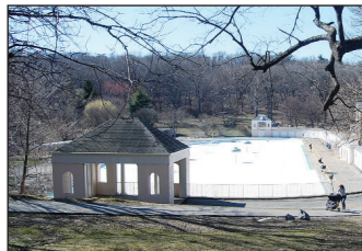
Tibbetts Brook Park Pool in its current condition on Midland Avenue