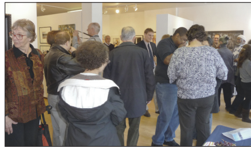
A large crowd attended the opening of The Blue Door Gallery.