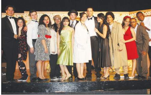
The cast of Lincoln High School's production of "Room Service"