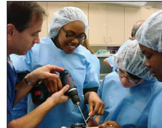
Gorton students learned how to bolt, pin together and insert supportive plates into broken bones.