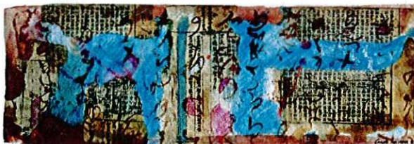
Palimpsest #3 12.5x36.75, Collage on Kozo Paper, 2007