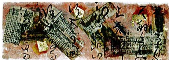
Palimpsest #4 12.5x36.75, Collage on Kozo Paper, 2007