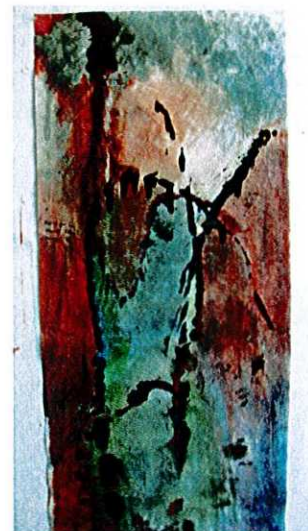
Complementaries, 20x50, 2004 Ink, Pigment, Pastel on Chinese Paper