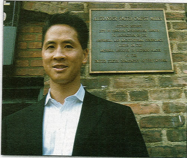
ALEXANDER SMITH CARPET MILLS NATIONAL HISTORIC LANDMARK CITY OF YONKERS, WESTCHESTER COUNTY IN RECOGNITION OF ITS NATIONAL AND INTERNATIONAL SIGNIFICANCE LISTED IN THE NATIONAL REGISTER OF HISTORIC PLACES BY THE UNITED STATES DEPARTMENT OF THE INTERIOR