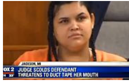
Judge Who Threatened Rude Killer Did What We All Wish We Stirring Daily