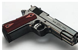
Woman's Lie on Facebook Profile May Have Gotten Her Killed Stirring Daily