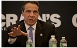
Gov may be beyond federal prosecutors' reach Crain's New York Business

Monday after the city controller questioned whether it followed