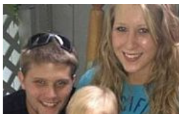
Johnny Cash's great-niece found stabbed to death in gruesome... MamasLatinas