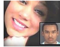
Teenage Girl Murdered By Her Boyfriend Found With Cement Blocks Tied To Her Body