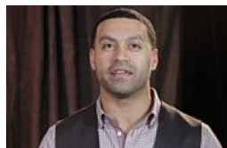
Apollo Nida's Co-Conspirator Found Guilty, Sentenced To 5 Hello Beautiful